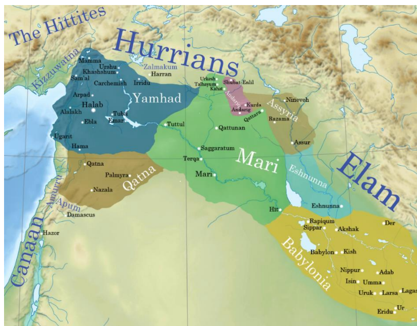
Figure 1: Map of the Fertile Crescent in the 14 th century BC showing the locations of Eshnunna, Andarig (in purple), Mari, and Assyria.

To assist the reader in following the geographical details provided above, we include below in our Figure 1 a map of the Fertile Crescent showing the areas mentioned as they existed in the 14 th century BC.