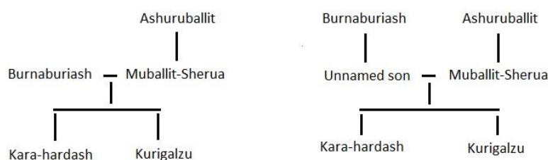
Figure 1: The Ashuruballit connection to the Kassite family of Burnaburiash (according to the Synchronistic Chronicle)

2. Without exception, scholars identify the Ashuruballit mentioned in this historical vignette with the 2 nd king of the Assyrian Middle Kingdom. We would expect nothing else, even if the document said nothing about Kurigalzu fighting a battle with an Assyrian king named Enlil-nirari